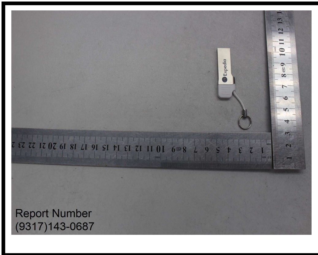
Photo of the Submitted Sample

LAB NO. : (9317)143-0687-R1 DATE : Jun 07, 2017 PAGE : 3 OF 9